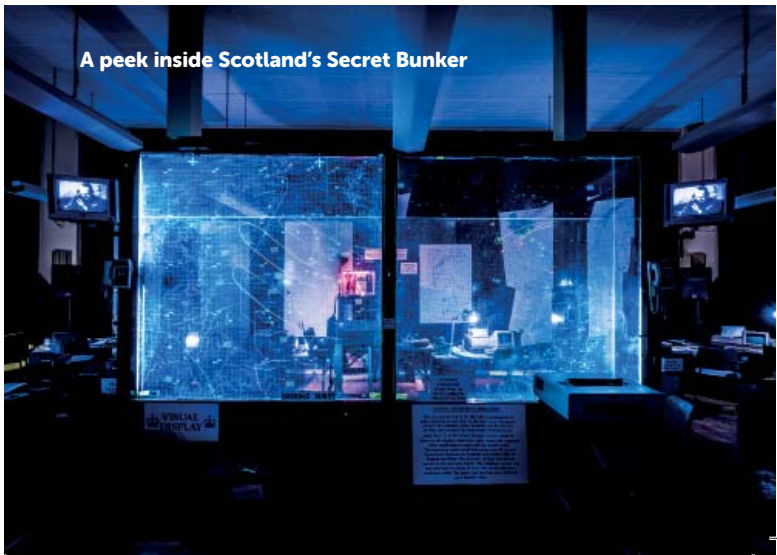
A peek inside Scotland's Secret Bunker